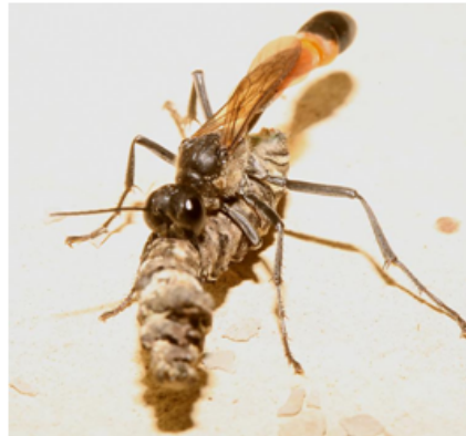
Wasp's eggs and caterpillar: wasp eggs hatch and burrow into caterpillar